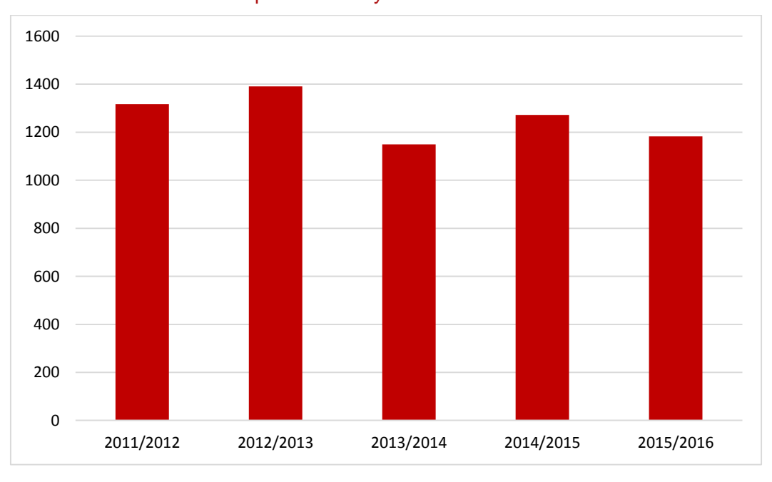
Exhibit 2: Total number of patients delayed between 2011/12 and 20/1516